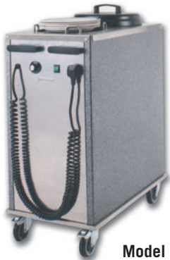
Model Shown Versalift Plate Dispenser HP2/10