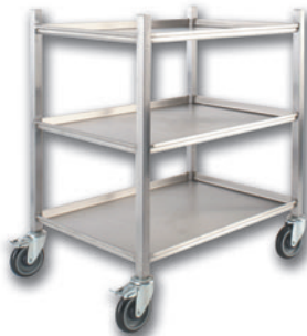
Model Shown T3 Trolley