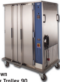
Model Shown Banqueting Trolley 90