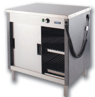
Model Shown HC12E