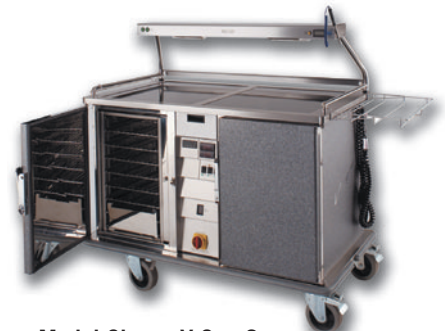
Model Shown V-Gen 2