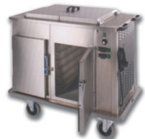
Model Shown BF2B