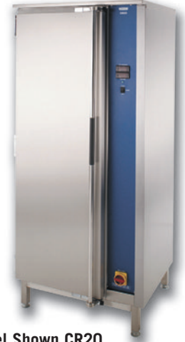
Model Shown CR20