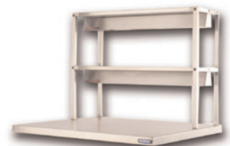
Model Shown Kitchen Gantry