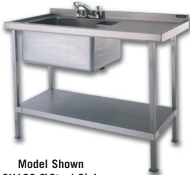
Model Shown SU126 S Steel Sink